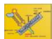
QUASAR Concentrator Plate Collector

"Vatsala-Damodar", 42/1, Sahajanand Society, Kothrud, Pune - 411 038. M.S.(India)