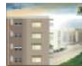
AKSON'S DELTA Ideal Solution for Buildings